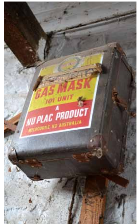
An ammonia gas mask.

As the saying goes, if you want to understand today, you have to search yesterday. The Tasmanian Cool Stores is quite the find. ▲