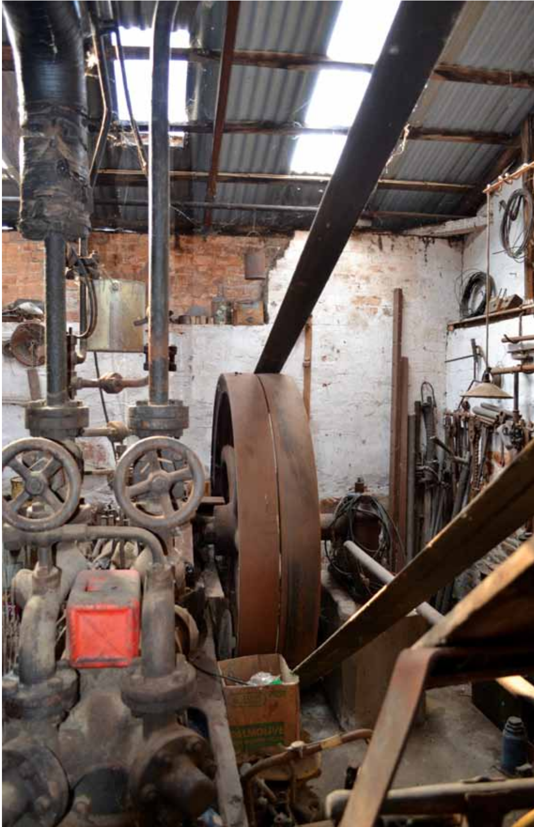
The large flywheel and belt.

"The fan is worked by shafting, driven by a 17-horsepower suction gas engine and compressors, put in the engine room. The two chambers which have been got ready carry 1,109ft of refrigerating piping . . ."