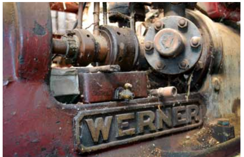
Werner Melbourne supplied two of three plant room engines.

"The output of apples and pears in Tasmania is increasing so enormously that some means must be adopted to profitably dispose of the fruit, and the solution of the difficulty will be found in cool storage, which, by prolonging the season to nearly or quite double the natural period, tends to vastly increase the demand and consumption in Australia."