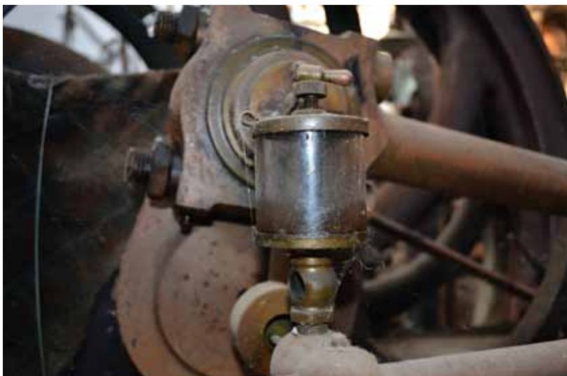
Oilers were used to lubricate bearings in machinery.