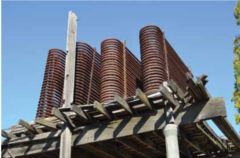
Rusty roof coils remain intact