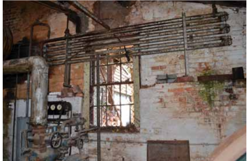
Cooling coils inside the cool store.